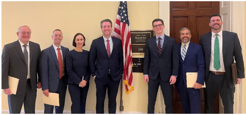
IIUSA outside of Rep. Russell Fry's (R-SC-07) office.