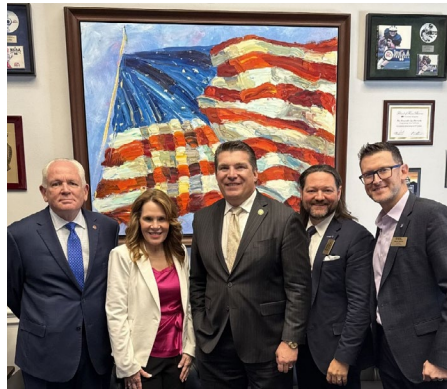
NTSC Board Members with Rep. Jay Obernolte (R-CA-23) (middle), former Chairman of the House AI Task Force & member of the Republican Data Privacy Working Group.

In March, TRC organized and hosted NTSC's annual lobby day, where dozens of NTSC members had the opportunity to converse directly with Members of Congress and their staff to discuss cybersecurity priorities for the 119th Congress. The NTSC met with the Homeland Security Committee members and members of the new Republican Data Privacy Working Group established by Chairman Brett Guthrie (R-KY-02) and Vice Chair John Joyce (R-PA-13) of the House Committee on Energy and Commerce.