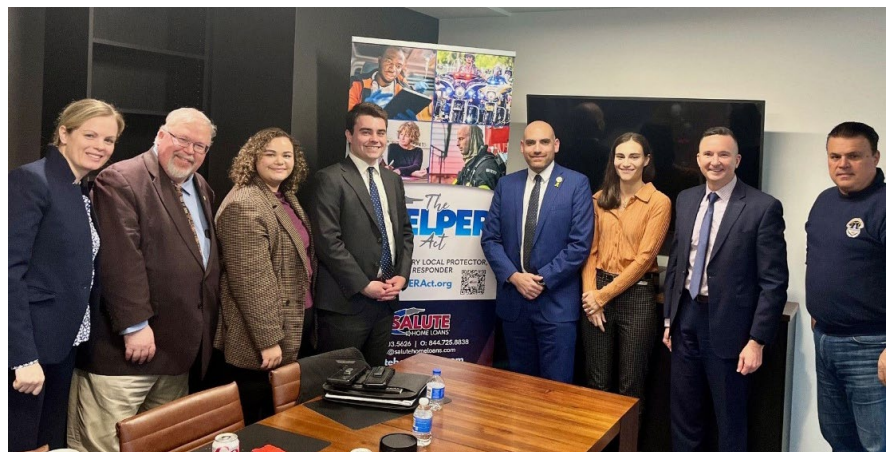
TRC hosts supporters of the HELPER Act and congressional staff in their office to discuss the legislation's reintroduction in the 119th Congress.

The Homes for Every Local Protector, Educator, and Responder (HELPER) Act was reintroduced in the House and Senate in March. The HELPER Act would create a first-time homebuyer home loan program under the Federal Housing